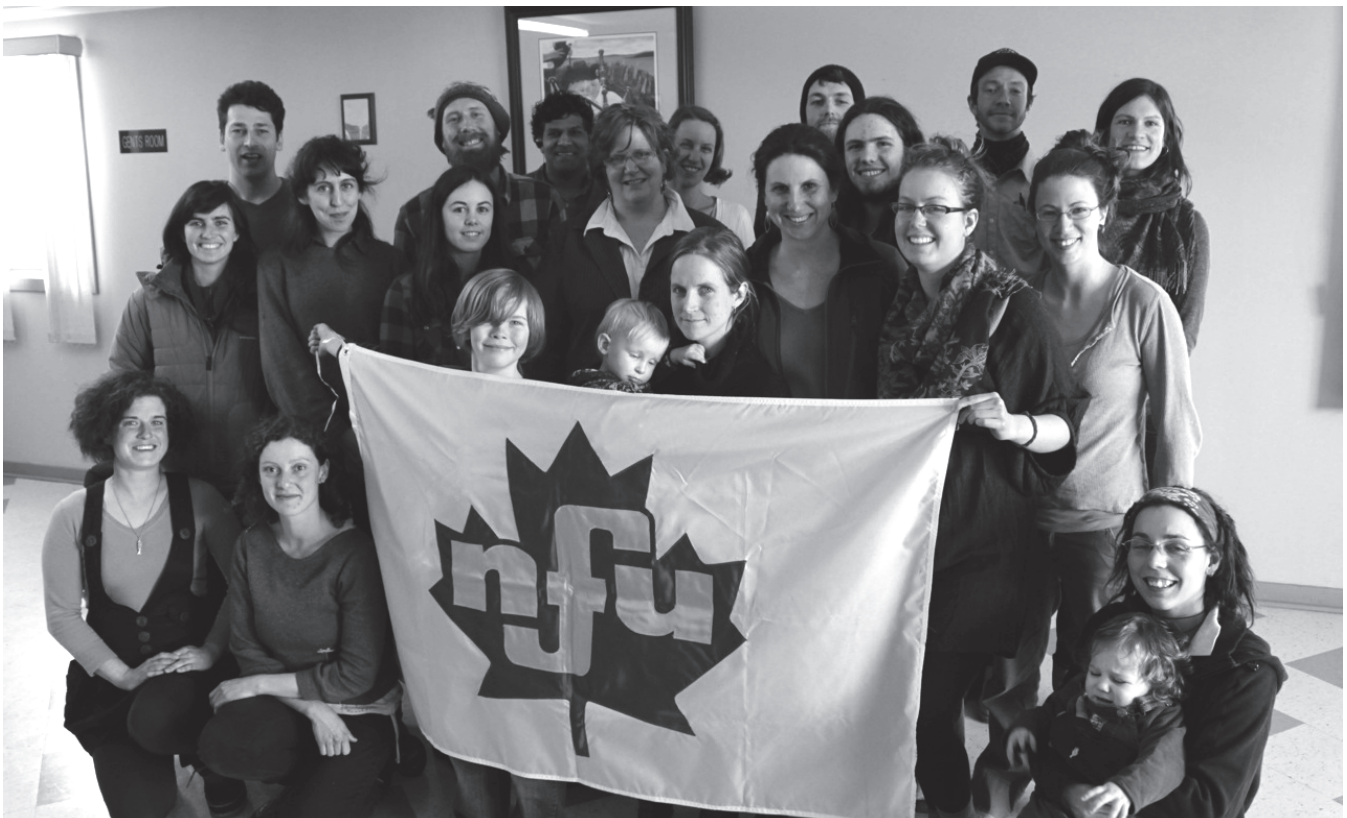
Photo: NFU Youth and Maritime farmers meet in Tatamagouche, Nova Scotia to talk food sovereignty and farming.