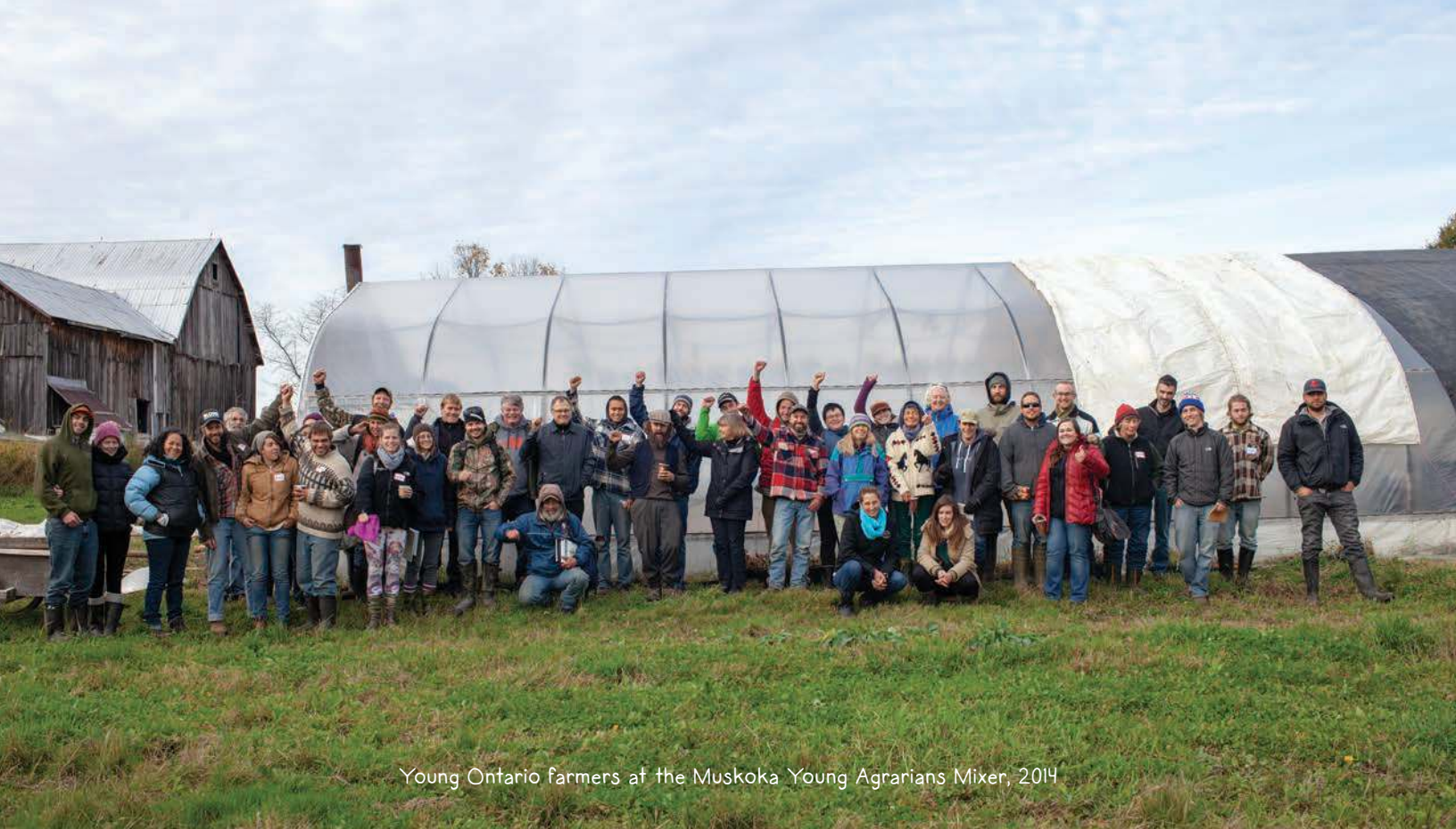
Young Ontario farmers at the Muskoka Young Agrarians Mixer, 2014