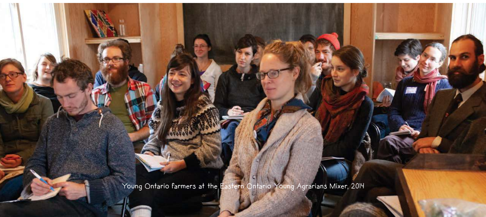
Young Ontario farmers at the Eastern Ontario Young Agrarians Mixer, 2014